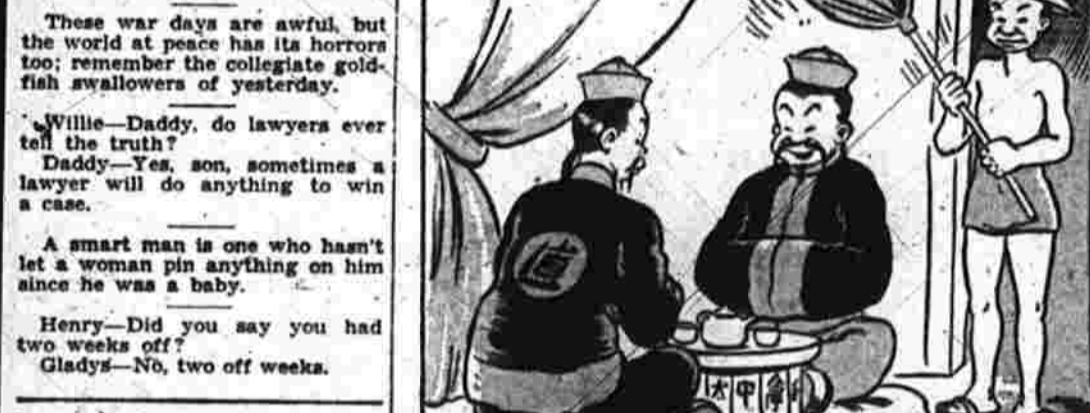
"Humble house very comfortable since I install new 'coolie system'!"

Hold Everything Sally—But surely you didn't let him straighten out your love life. Judy—No fear—he had to squeeze it out of me. These war days are awful, but the world at peace has its horrors too; remember the collegiate goldfish eye-brothers yesterday! Willie—Daddy, do lawyers ever tell the truth? Daddy—Yes, son, sometimes a lawyer will do anything to win a case. A smart man is one who hasn't let a woman do anything on him since he was a baby. Henry—Did you say you had two weeks off? Daddy—No, two off weeks.